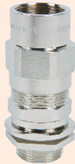
Steel pipe wiring